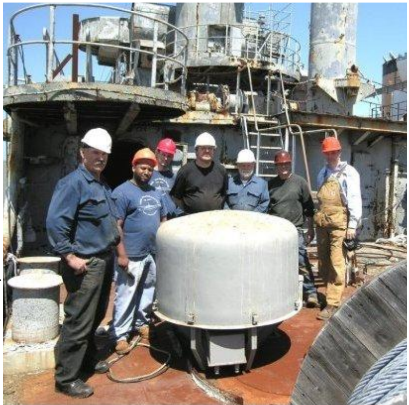
We couldn't have done it without them - Volunteers from the USS PAMPANITO and the last know example of an SL radar antenna on the deck of the CLAMP.