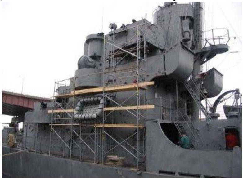
The port side scaffolded and ready for painting.