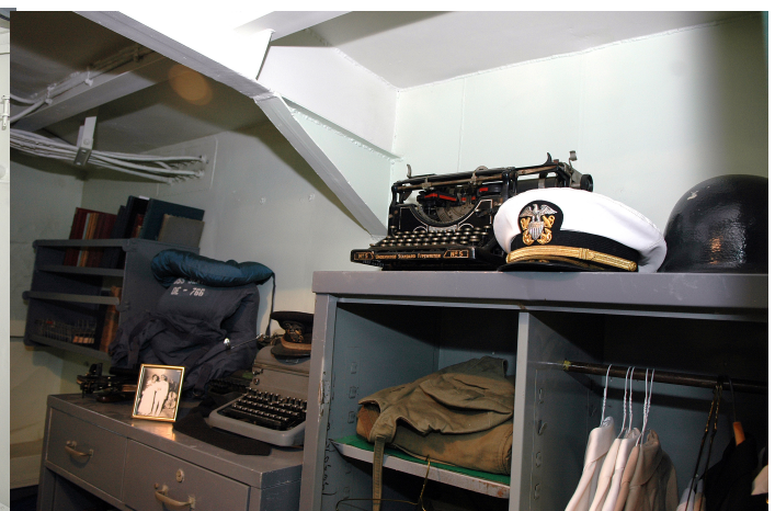
The Exec's Stateroom.