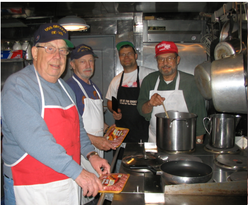
Some might say that a crackerjack welder behind a grill is a real waste of talent.