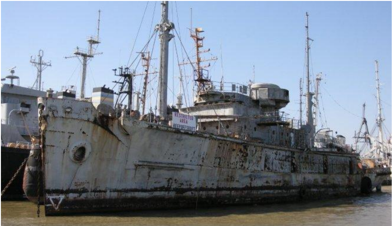
Still yielding treasures on her way to the scrapyard, the USS CLAMP ARS-33 in the Suisun Bay Reserve Fleet.