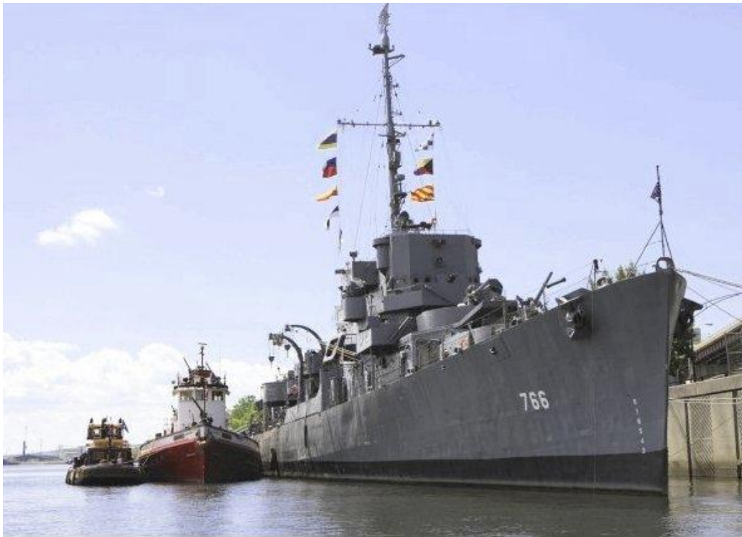
Three Historic Ship's moored together, the tug URGER, the JOHN J HARVEY and the SLATER.

We got back from vacation in time for the next big event of the month, the annual visit by the fireboat JOHN J. HARVEY from Manhattan. The annual visit by the HARVEY is a major event because there is always a great party by the two groups of volunteers. The HARVEY arrived on Monday August 15 th for a brief stay to off-load passengers and load passengers for the trip to Troy. We welcomed them to Albany with a gun salute from our newly restored aft three-inch gun. From Troy, they went on to overnight in Waterford, and they returned Tuesday at 1500 and moored alongside the SLATER. They had company. The historic New York State Canal tug URGER accompanied the HARVEY and nested outboard, so we were three abreast. The tug was a classic sweetheart. Meticulously maintained by the NYS Thruway Authority's Canal Corps. The brass was polished and the engine room was spotless. She was a role model for all of us.