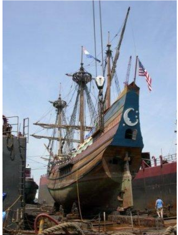
If only it were us in dry-dock!