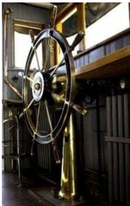
The helm on the tug URGER.