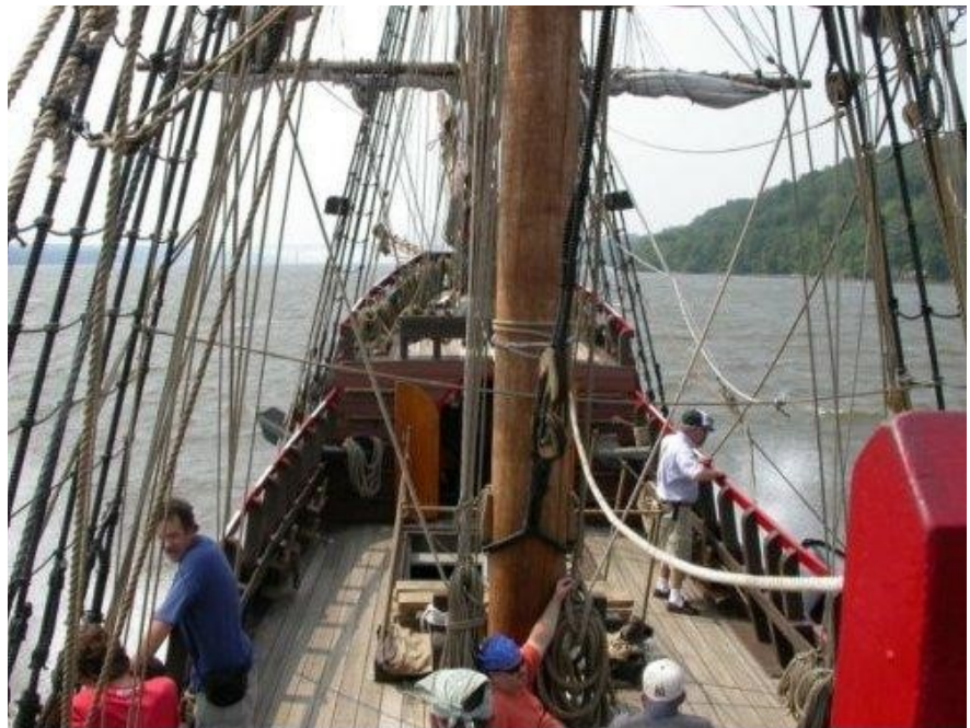
Heading down the Hudson River aboard the HALF MOON.

The visitors (crew) sleep on the deck, while the old hands have the few bunks or hammocks. Steering is done by whip staff, a vertical staff hinged to the tiller on the gun deck below. In a stiff breeze you have to throw your whole body weight against it to stay on course. On the plus side, the whip staff is in an enclosure below the poop deck, so at least the helmsman is out of the rain and sun. The down side is that the raised foc's'cle gives you no forward visibility, so when they tell you to hold course off the cell phone tower dead ahead, you can't see the cell phone tower that's obvious to everyone else. They conn the ship from the poopdeck, out in the open, and yell steering orders to the helmsman below. The same for the bow lookout, who has to yell the length of the vessel and point out oncoming ships, obstructions and landmarks. When it comes time to raise the anchor you put the poles in the capstan, and all hands heave round the windlass on the main deck, as the anchor rope