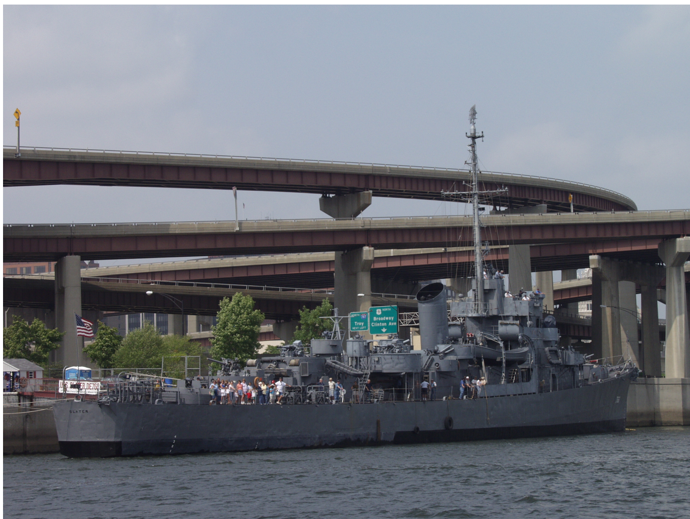
View from the HARVEY.