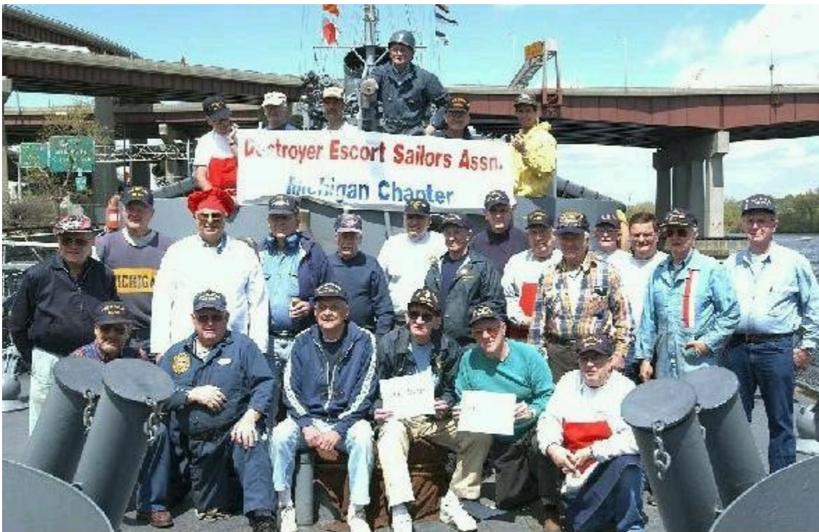
This was the eighth field day week for the Michigan DESA chapter.