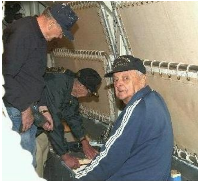
The Michigan crew working on locker tops in the Museum Space.

It was a great two weeks for all hands. It's a small step forward, but if the crew stays as fired up as that engine was, this old girl just might move again one day. The big problem now is to find some funding for the project so they can have a source of parts, as they get deeper into the overhaul. It would be appropriate at this point to get into some of the philosophical reasons for getting into the engine work. Our primary mission is the preservation of the USS SLATER and her technology as a historic artifact to serve as an educational tool. Operating SLATER under her own power, for many, may not seem practical and feasible for our small organization. We won't know that until we get further down the road. However, we view getting the equipment in operating condition as an important part of the preservation process. Even if an engine is only run once a quarter to warm it up and then shut it down, that makes the difference between preserving an engine, or a frozen hunk of iron. Another reason for going down this road is that it brings life, people and activity onto some very cold dark places in the SLATER .