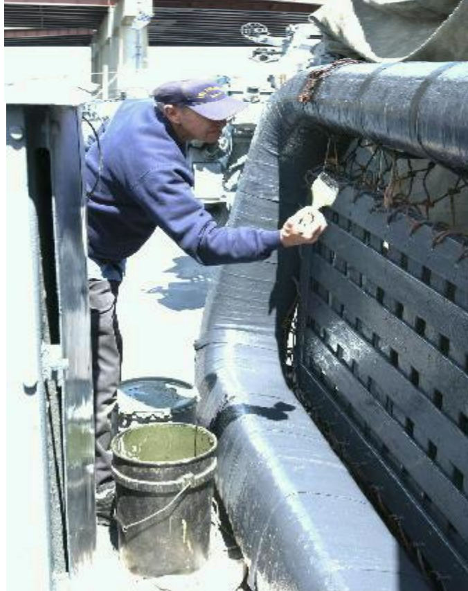
A life raft getting a final coat of paint.