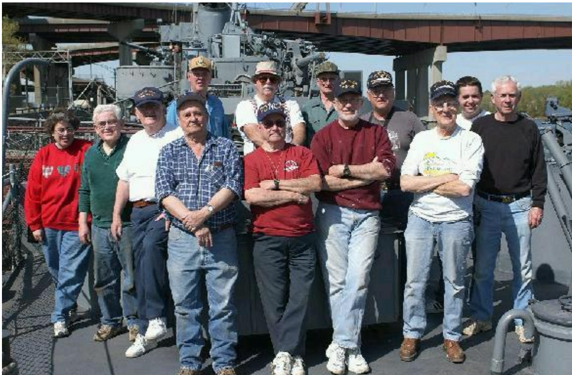
The USS Hume and Illinois shipmates take a break.