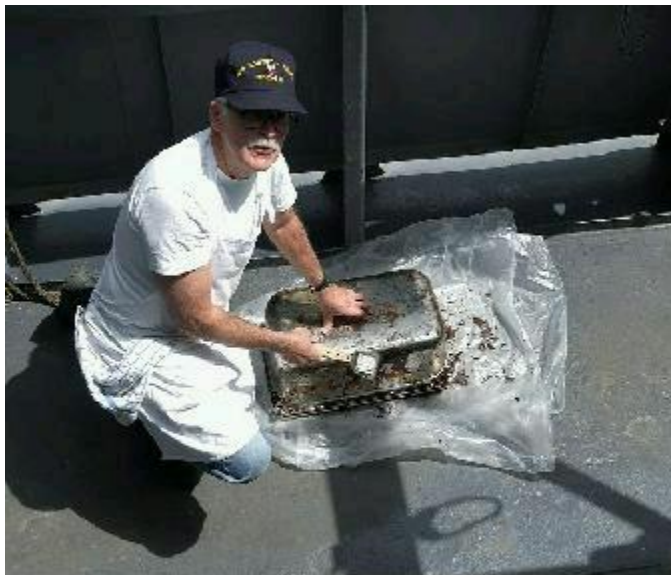
A messcook's job never ends.