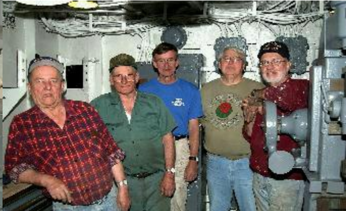
The USS Huse crew poses in the freshly painted machine shop.