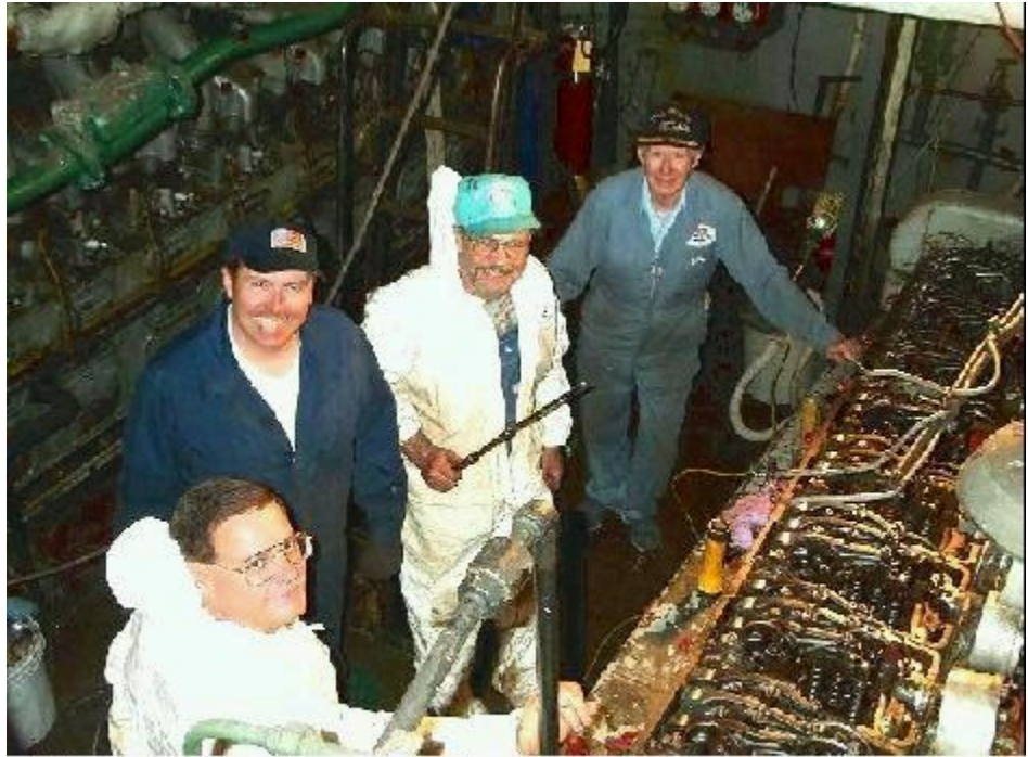
Slater Engineers working on the number two ship's service generator.

The one small bit progress we didn't address is what has been happening down in the engine room. The big bit of restoration news is that the engineers rolled Main Diesel number four, two complete revolutions on air. They got the HP air compressor and starting air system hydro tested and working. They got oil in the sump. They jacked the engine by hand, and opened all the cylinder cocks. They prelubed it. They built 450 pounds on the starting air cylinders and let her turn. They were hesitant to go further because they were concerned that the generator bearings weren't getting any lubrication. Larry LaChance, Chuck Longshore and Russ Ferrer are progressing in their effort to restore the fire and bilge pump in B-4.