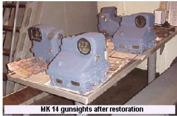
MK 14 gunsights after restoration