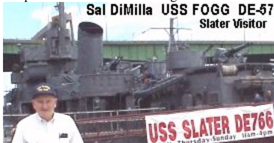
Sal DiMilla USS FOGG DE-57 Slater Visitor

Chapters who have been feeding their kitties with "Pennies For Slater" - Recently we have received checks from the