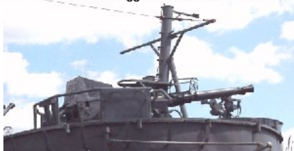
Antenna - Rigged to Aft Main mast crossarm

The radio gang had their big weekend of communication with other historic naval ships, the final numbers aren't in, but we guess they made contact with just about everyone in the fleet. This is an annual event sponsored by the USS SALEM , in Quincy, Massachusetts.