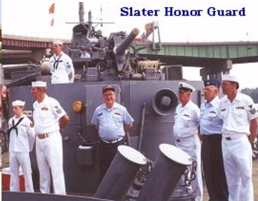
Slater Honor Guard