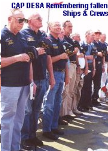
CAP DESA Remembering fallen Ships & Crews