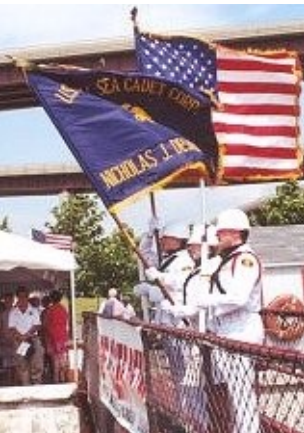
Sea Cadets Present Colors