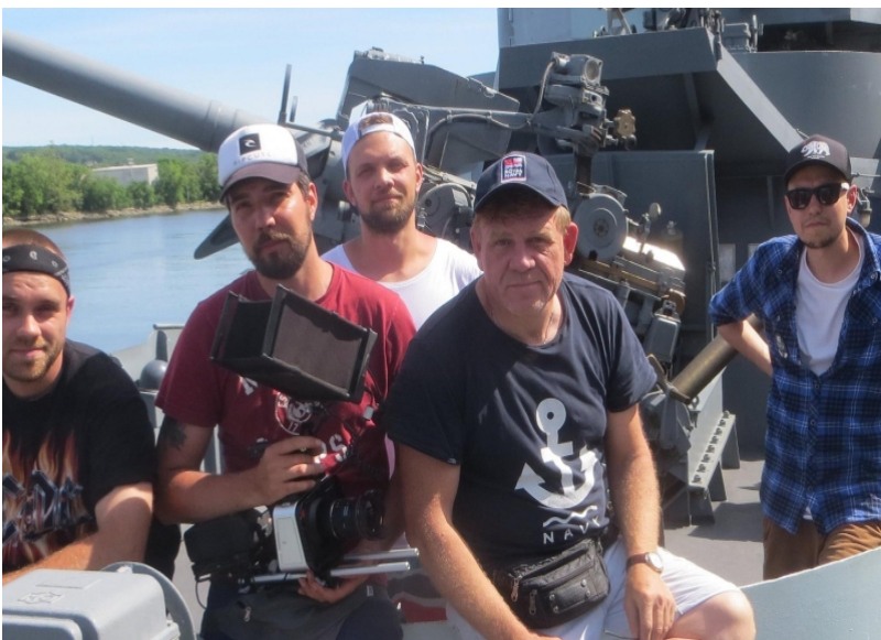
The World of Warships film crew from St. Petersburg.

interesting to note that both the USS SLATER and the USS WILLIAM SEIVERLING were named for men who died during the battle of Guadalcanal.