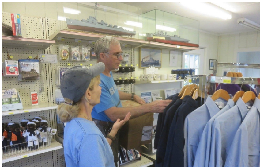
The Ship's Store is now selling new 20th anniversary t-shirts.