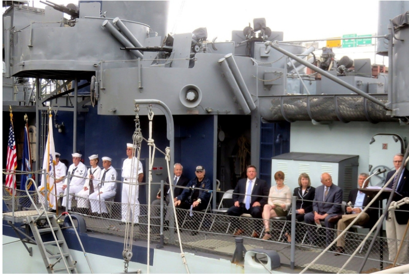
Our DE-Day commemoration was a well-attended event.