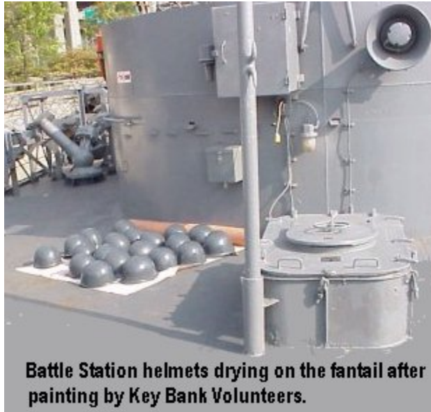
Battle Station helmets drying on the fantail after painting by Key Bank Volunteers.

An unexpected source of support came from Key Financial Group. They organized a community workday for their employees, and SLATER was one of five sites chosen to benefit. Jim Cole organized the effort, and nineteen white-collar workers dressed down and reported aboard to work. They split up into four crews. The first group vacuumed and primed the deck up on the open bridge. A second group repainted the aft liferafts and supports. A third group scaled and primed the decks on 20mm gun tubs 24 and 25 amidships. A fourth group did repainted the line reels on the 01 level aft, painted helmets, and trim work on the 40mm guns. It was a great experience for all, and we hope they come back in the spring.