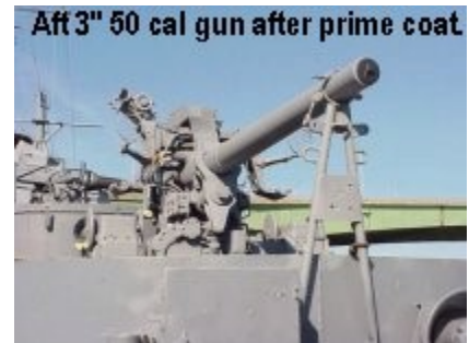
Aft 3" 50 cal gun after prime coat