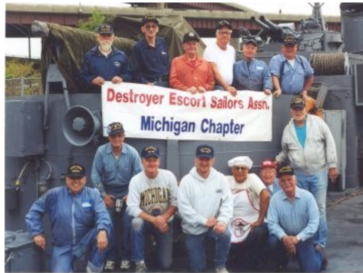
Michigan DESA and Albany Joint Work Crew Assembled on fantail