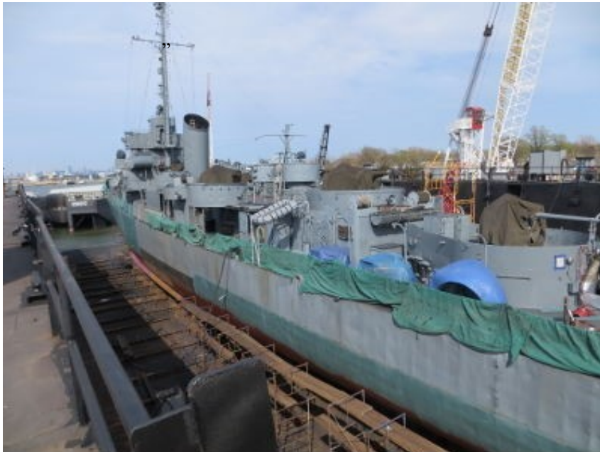
View from the wing wall.

It's Tuesday night aboard USS SLATER at the shipyard in Staten Island. 2100. Everyone is asleep but me. The ship seems unusually quiet after the bedlam of the day's activity. By now everyone reading this should have received my latest and hopefully last solicitation for hull fund donations. Nothing is truer than the statement that on a daily basis, critical decisions are made based on the available funding. The way it goes is, prior to the overhaul, you tell the yard what you want done and they give you a fixed price based on your list. Then when you get there, the surprises begin; problems you hadn't anticipated, things you forgot, and things that you realize will never get done in Albany. When Rosehn tells me that another big donation came in, I go straight to the yard and say, "You know that add-on job we were talking about? Do it."