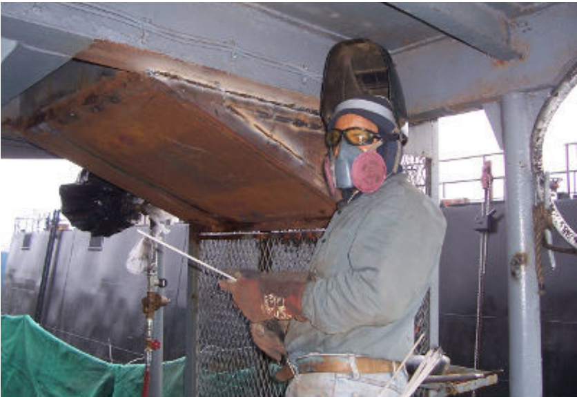
Finishing the 40mm cage.