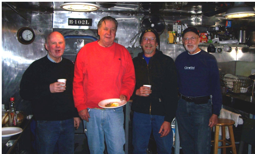
Week four crew.