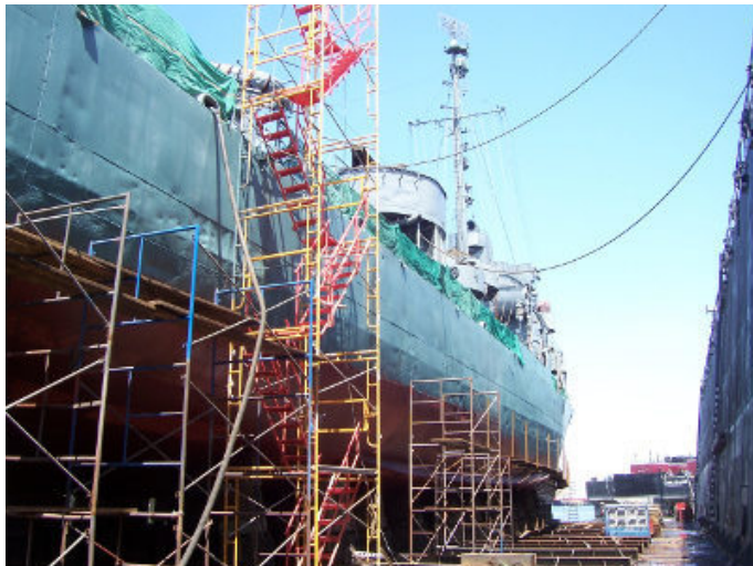
Now that the hull number is gone she really is every DE to every DE Sailor.

The sandblasting of the hull and freeboard is well underway. One more day and the hull will be finished. The yard crew is hanging angle iron supports in a line just below the waterline so they can snap a straight line for the ice band doublers. The steel has started to arrive and the first plates are being installed. The first load of paint appeared on the dock by the gangway and the hull is being primed the same day it is blasted, to prevent new rust from rain. I really wasn't prepared for the mess that sandblasting makes inside the ship, despite our best effort to seal up the doors and ventilators. I spent the first week throwing sheets over furniture, tightening porthole dogs and taping up around doors.