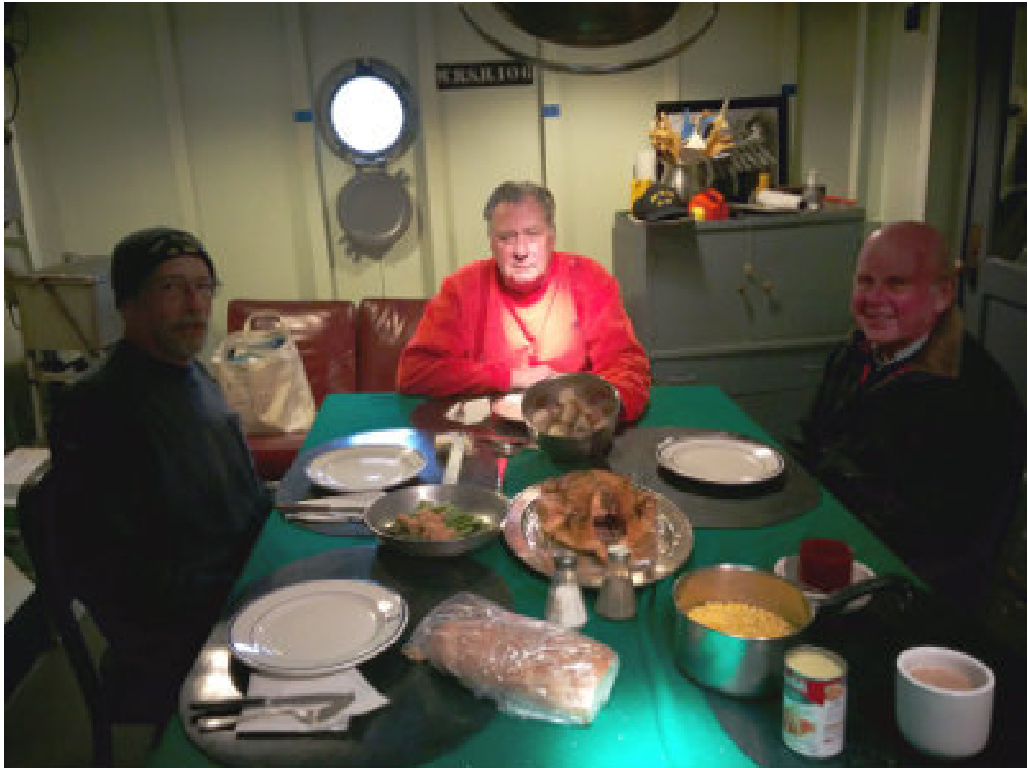
Formal dining in the Ward Room.

There are several more items that are more convenient to do in shipyard. Included are to scarf off accommodation ladder supports, open up a port for pumping forward, open up port for sand blast cabinet exhaust, finish welding on port 40mm shell cage, since it's right by our gangway, install missing section of mast ladder, grit blast waterways and snaking tie down bar, grease the shrouds, spot blast main deck aft, move the practice loading machine to original position, repair some rot in stack cap, repair the wasted steel under the searchlight platforms, fabricate gaff on stack for the battle ensign, and repair the dent in the port bulwark, including removal of the Greek davit pedestals. There are also three water tight doors that need replacing but it looks like the final tally will be $1.5 million, so we'll be dipping into the endowment.