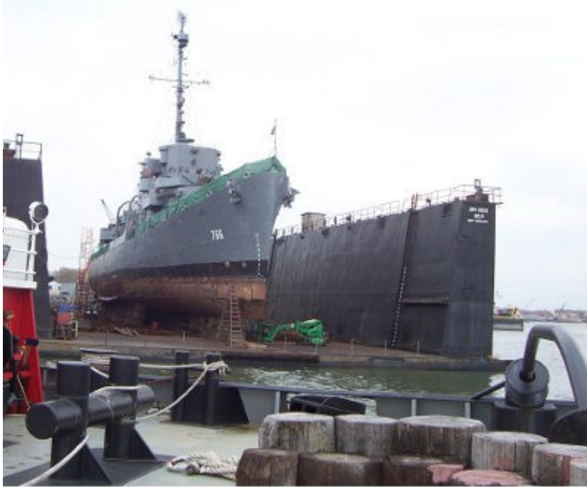
High and dry at Caddell's ship yard in Staten Island.

Phone (518) 431-1943, Fax 432-1123 Vol. 17 No. 4, April 2014