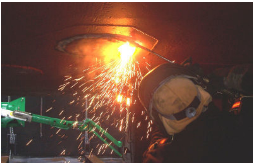
Burning off old blanks.

They've been prepping and painting the storerooms forward before we fill them back up again with all our "junk." Eddie Z made a significant discovery. One of the design characteristics of WWII DEs is that the bilges in the aft magazines are decked over and the false deck is welded in place. There is no way to maintain the bilge below. Our guys started cutting into it, and the condition of the bilge below was a disaster. A couple frames were rotted right out. We knew we had to address this in the yard, because it would be most unfortunate to put an air chisel through the bottom back in Albany. So we instructed the yard to cut away the false decking, clean and preserve the bilge, and install a removable lightweight fiberglass decking. Another expensive add-on. That project is well underway.