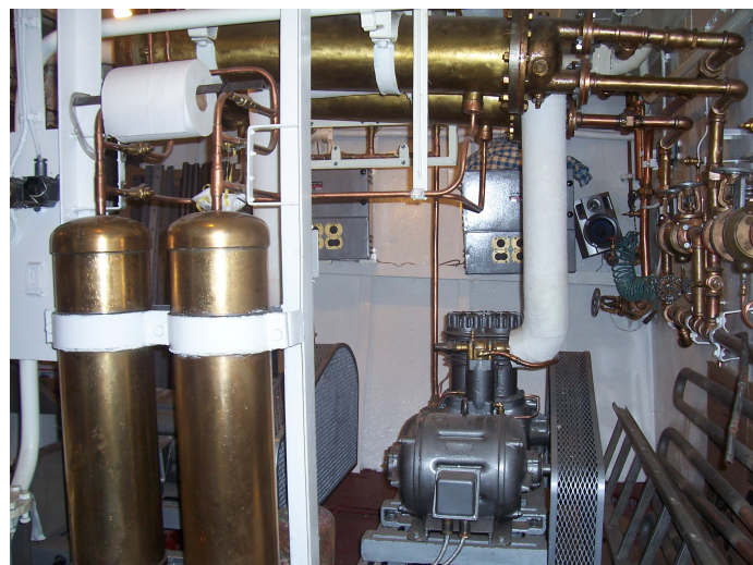
The reefer deck.