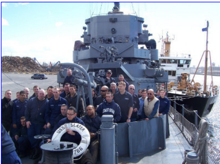
Our new Coast Guard friends with the USCGC Katherine Walker alongside.

Amid the coffee controversy, the work to get the ship ready to move and open continued to progress. The galley welding, the sink drains and the expansion joint were all completed. The engineers repaired the cooling leaking on the emergency diesel generator and test fired the engine. The RPI Midshipmen uncovered all the guns and stowed the canvas. The bridge deck grating was pulled out up the upper sound shack and put in place. The radiomen got the TBL motor generator put back together and the radio room is starting to look like a radio room again instead of a motor rewind shop. Joe Breyer completed his repairs to the SA Radar “A” scope simulation. “Boats” got all his heaving lines and fenders prepared for the move.