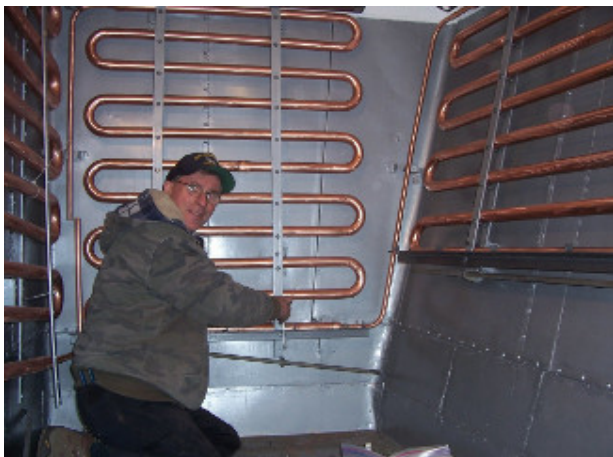
The rehabbed starboard reefer.