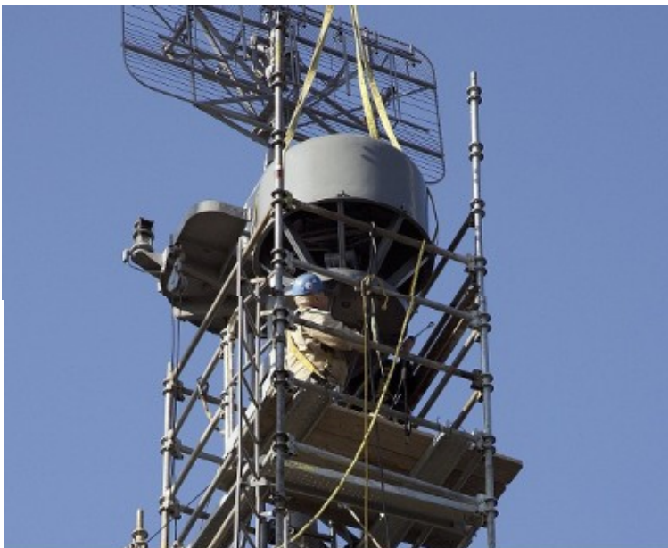
Doug Tanner in his element.

In the Navy, these kinds of men usually end up in rates that involve moving heavy objects, making loud noises, playing with fire, hand to hand combat, or aerial dog fighting. Don't get me wrong. They are not universally admired. Sailors of the more refined rates such as yeomen, storekeepers and electronics types consider their macho shipmates uncouth Neanderthals, totally lacking in finesse and social graces, rather like the proverbial bull in the china shop. That is until the wind rises above force 8, water starts pouring in or the shooting starts.