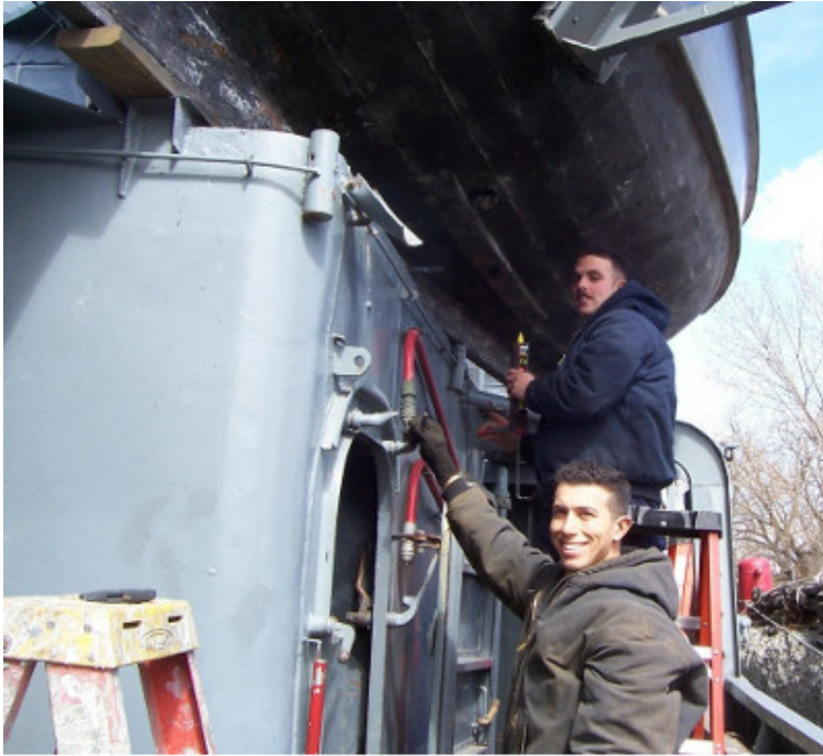
Helping Rocky on the whaleboat.

alongside side of us in Rensselaer, at a rather remote and desolate wharf, and not easy or cheap way to get to the bright lights and big city.