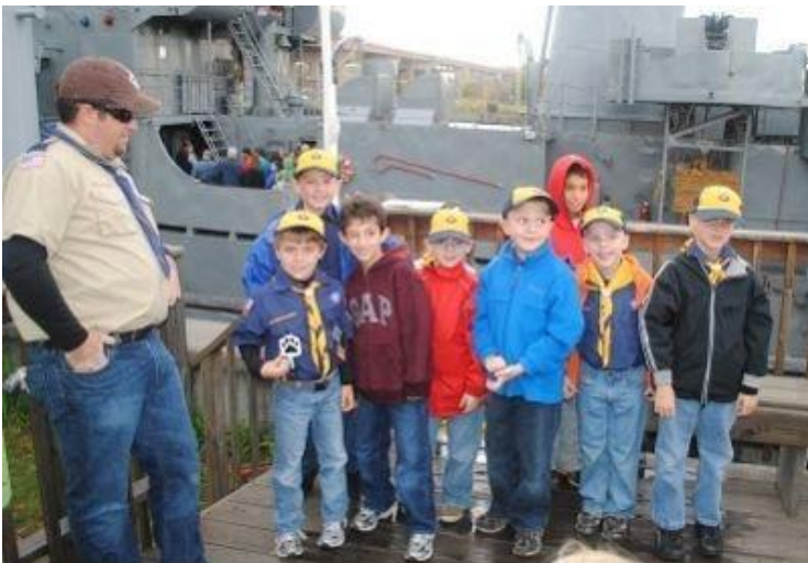
The last tours of the season.