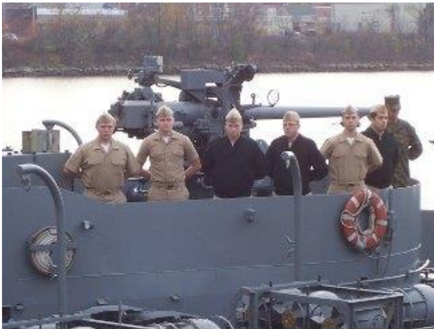
RPI Midshipmen serving as our gun crew.