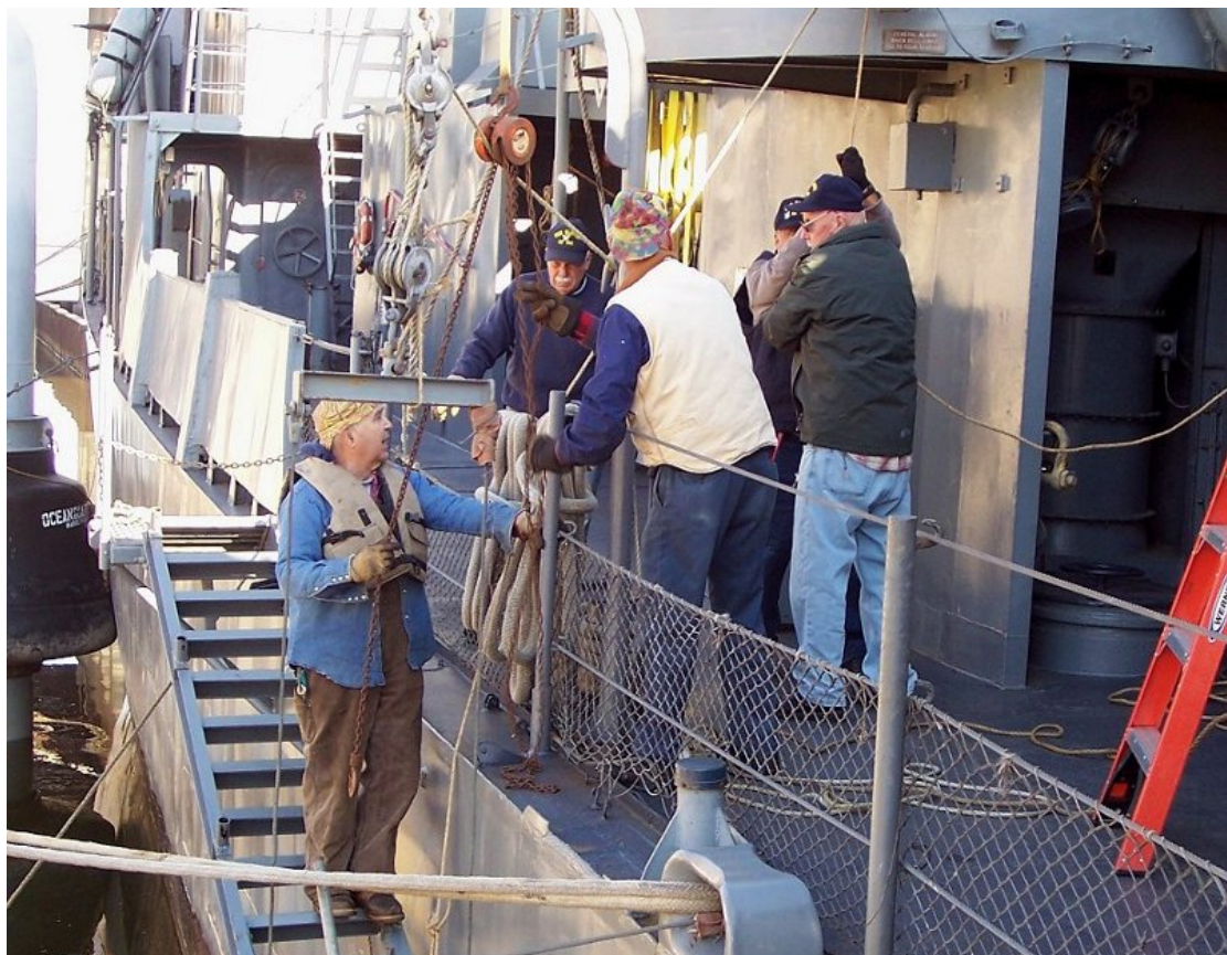
Bringing up the accommodation ladder.

November is that month where so many years we had said to ourselves, "Why the hell are we still open?" By this time all the other riverfront attractions, The Albany Aquaducks, The Dutch Apple Cruise Boat, the Captain JP and the Riverfront Barge Bar and Grill have all shut down for the season. But not us. We're tough and we hang in to the bitter end. And, this was the year that it paid off. Despite the scare of that late October snow storm, November turned out to be a wonderfully mild month with lots of good days, good for painting and good for visitors.