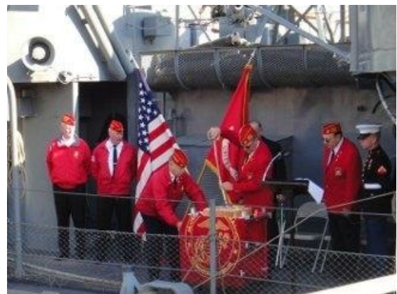
States Marine Corps.