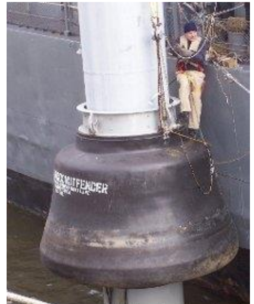
Won't somebody please hold my safety line?