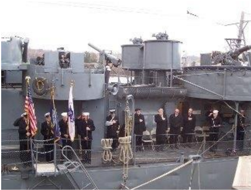
Our Veterans Day Observance aboard USS SLATER.