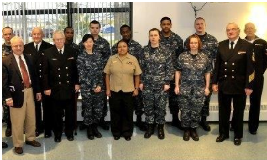
Our "Old Navy" mingled with the "New Navy" at the Schenectady County Military Affairs Council "To Honor and Serve" breakfast.