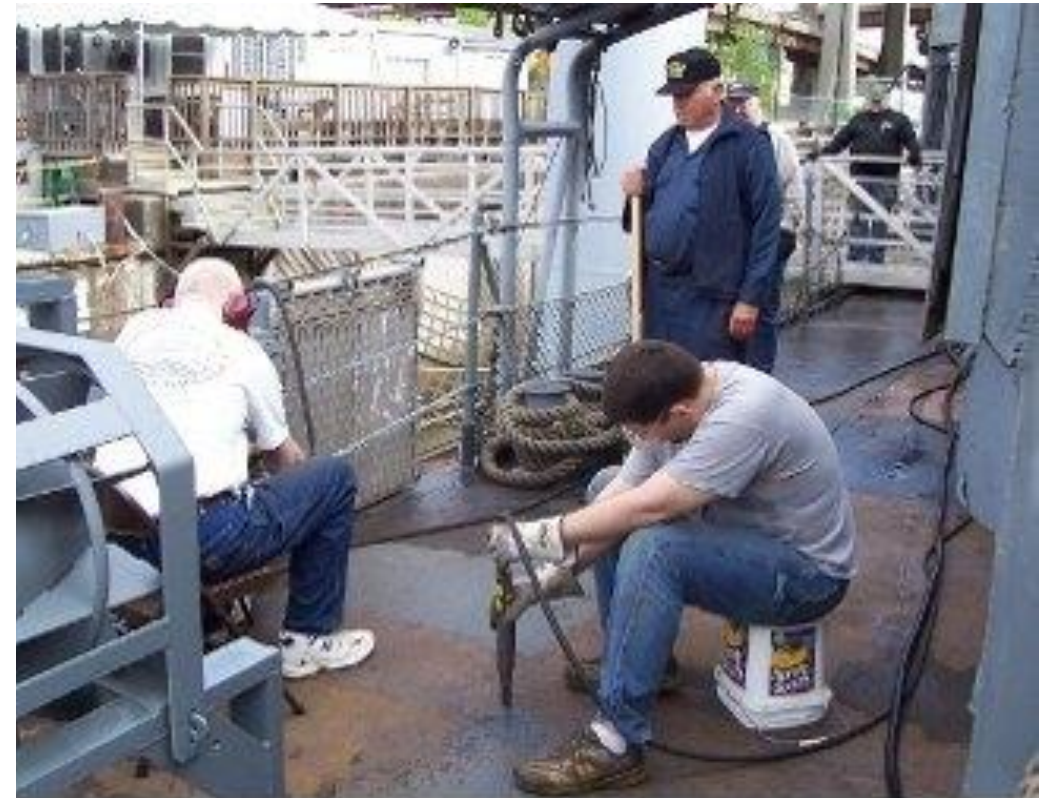
The "Huse Chippers" hard at work.