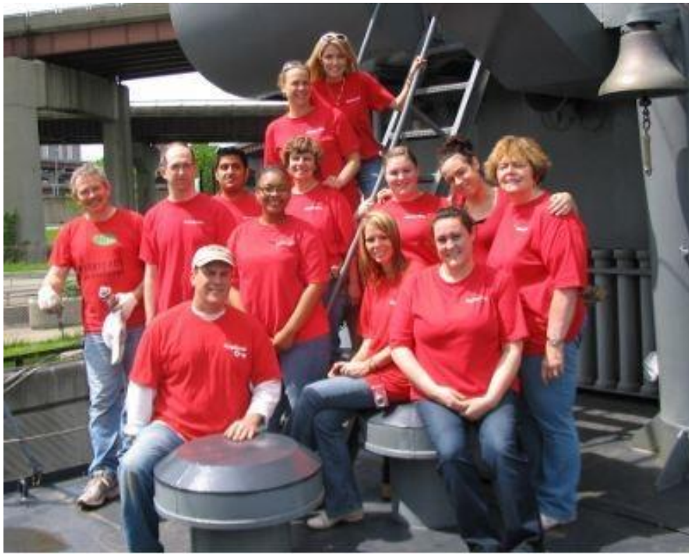
The Key Bank "Neighbors Make a Difference"

Once again, Key Bank sent down a crew of volunteers during their annual "Neighbors Make a Difference Day." The Key crew arrived in the early afternoon and was split into three groups: ship cleaning, gardening and picnic table dismantling. They got right to work with the cleaning crew attacking the aft berthing areas that needed some attention after the Michigan and Huse work parties. Decks were swept, bunks and bedding tidied up and the compartments generally straightened up. On shore two old picnic tables were quickly dismantled and hauled away. The gardeners trimmed grass and weeds around the Victory Garden and then set about preparing the garden for spring cleaning. After an hour of hard work everyone took a break to tour the ship. After a group photo it was back to work. The cleaning crew made such quick work of the aft spaces we moved them to the forward areas of the ship where they cleaned bulkheads and straightened bunks on the messdeck and forward bunk room. We thank Key Bank for their continued help and support.