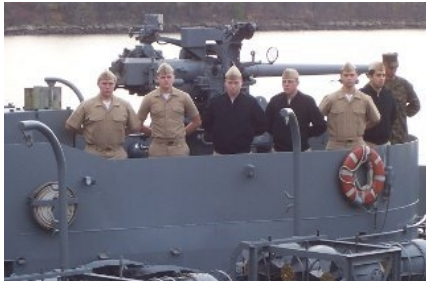
RPI Midshipmen serving as our gun crew.

I've mentioned several times in the past, I'm a technological dinosaur. No where is this more evident than in my failure to embrace cell phone technology. I'm a writer, not a talker. While I love email, I didn't even like telephones when they had wires. I grew up in a time when telephones had wires so it was okay to be out of touch. In fact, I still think it's okay. Not only okay, it's a right. The people who work with you take a lot more responsibility and initiative if they don't feel like your hovering over every decision they make from afar. Yes, I do have a cell phone. It's six years old. It usually sits in my briefcase waiting for your calls, when I remember to charge it. And if you call, there's only a fifty/fifty chance that I'll hit the right button and talk to you instead of cut you off. That's if I hear it at all. It is a good message collector. There have been rare moments when I have found it useful, such as when the welders set off the fire alarm and all the phone lines are busy. Or I'm out of town. But generally, it's a modern accessory I feel I can live without. I don't need to feel connected all the time. Some people may think that's kind of sad. But what's really sad is that I haven't turned sixty yet, but I'm already starting to write like Andy Rooney .