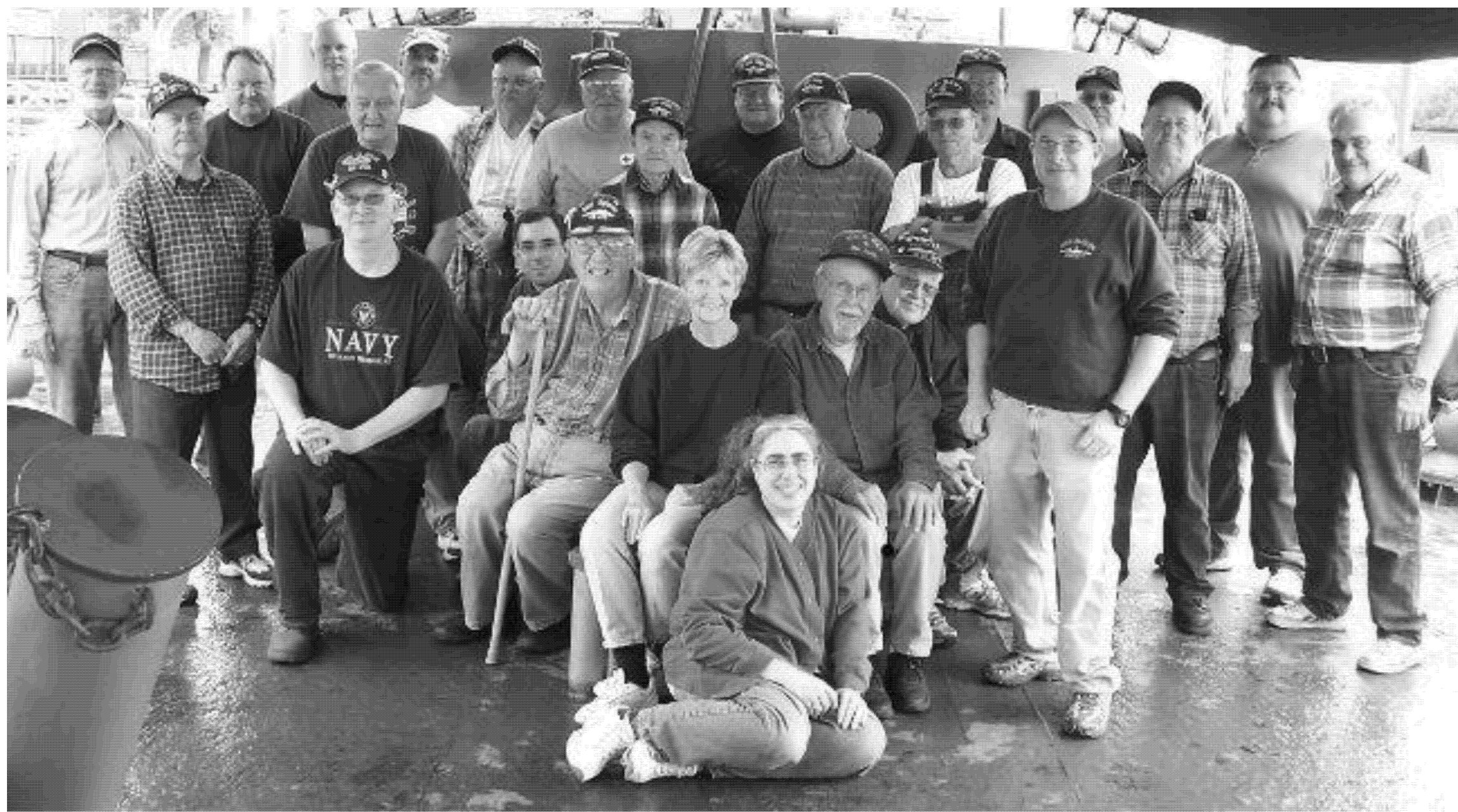
The USS HUSE Work crew under the fantail awning.