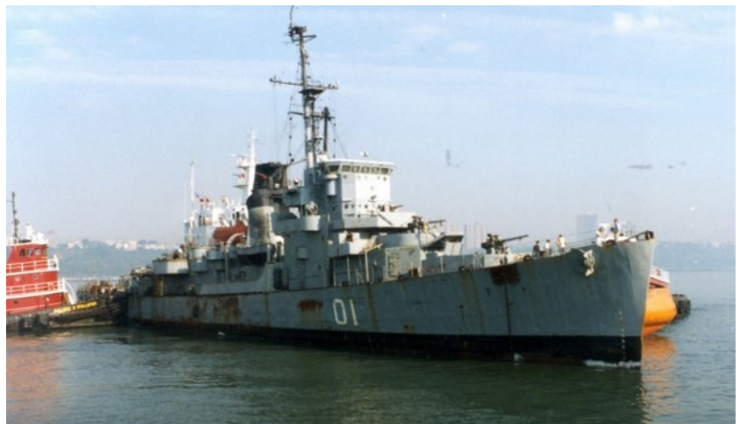
The Arrival of HNS AETOS at the Intrepid Sea Air Space Museum in 1993.