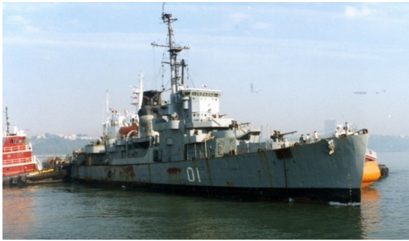
The Arrival of HNS AETOS at the Intrepid Sea Air Space Museum in 1993.