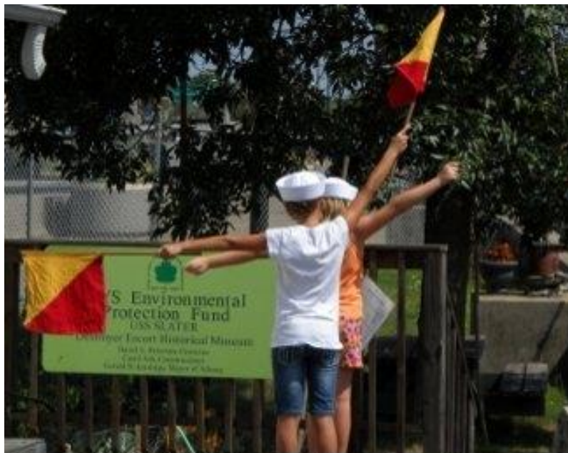
Education programs on the observation deck include semaphore signaling...