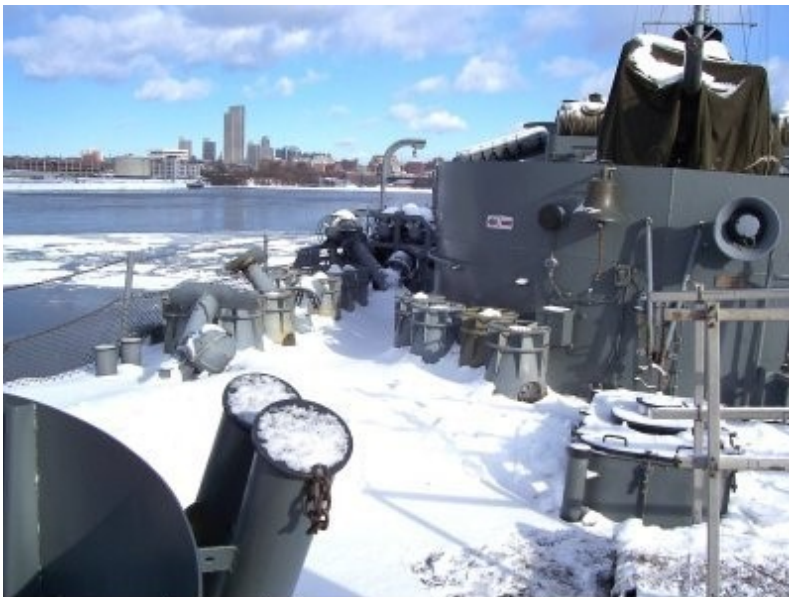
Ice covered the decks as we haven't had four days above freezing all January.

Phone (518) 431-1943, Fax 432-1123 Vol. 12 No. 1, January 2009