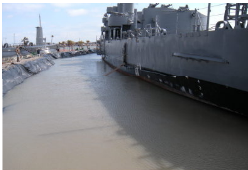
The STEWART afloat and back on an even keel.