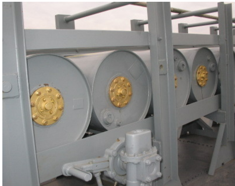
Replica pistols mounted on fantail charges. The improvement to the charges is amazing.