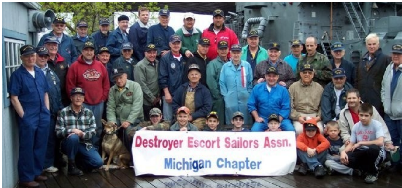
The biggest Field Day crew to date!