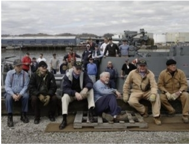
The crew waiting for Tanner to arrive.

to think it was a contest as to whether they could beat the line handlers and get the shore tie connected before the mooring lines were doubled and the wires on. Gus and Karl secured the diesel, and by 1600 we locked the SLATER for the night and disembarked onto the camels, pulling the ladder up behind us.