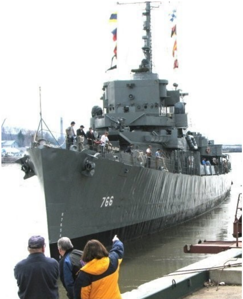
USS SLATER returning to Albany for another summer season.