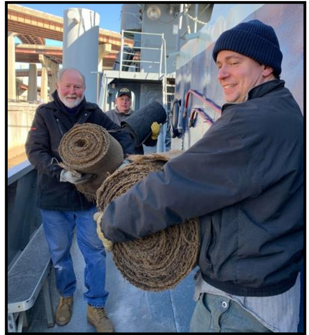
The Deck Crew brought up the coco mats.

We are hoping to go down in June, but right now, all bets are off. In compliance with Governor Cuomo's stay at home order; we have suspended volunteer activity aboard the ship until the order is lifted. The question I asked the crew was, "If you caught coronavirus from someone down on the ship, and got pneumonia and died, would your last thought be, "Why didn't Rizzuto close the ship down?" So, I closed the ship down.