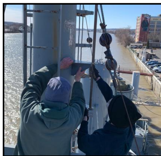
The first pieces of WWII replica gear getting welded onto the mast. These are the brackets that will serve as guides for the bullhorn control rod.