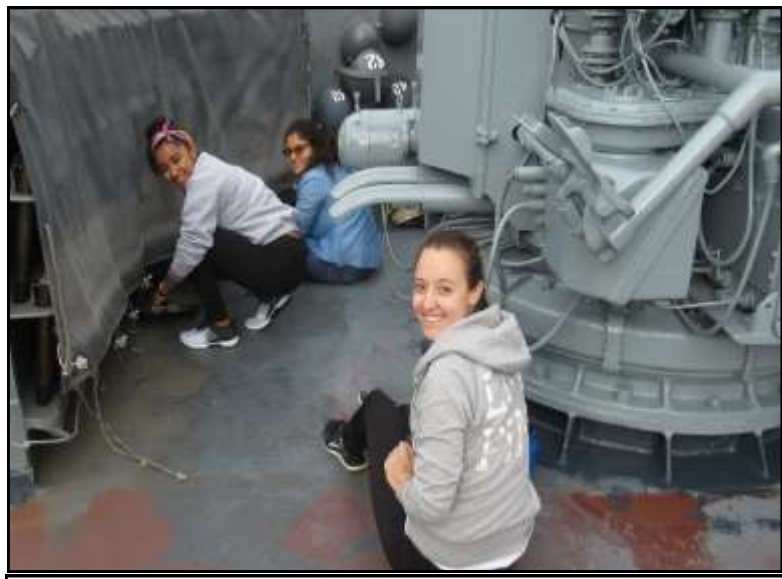
Part of the Regeneron Crew painting the 01 level amidships

eron Pharmaceuticals did a service day aboard the ship. Kevin Sage had gotten the amidships 40mm guns sprayed out, and the Regeneron volunteers finished painting the deck around the guns. They also painted out the fantail 20mm gun tubs, ready service lockers, and did a lot of cleaning. They left us with a pile of good paintbrushes, rollers, and frames, as well as pails. We hope this becomes an annual event.