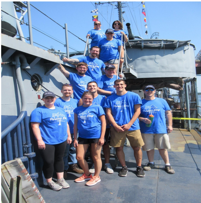
The volunteers from Bonadio take a break.