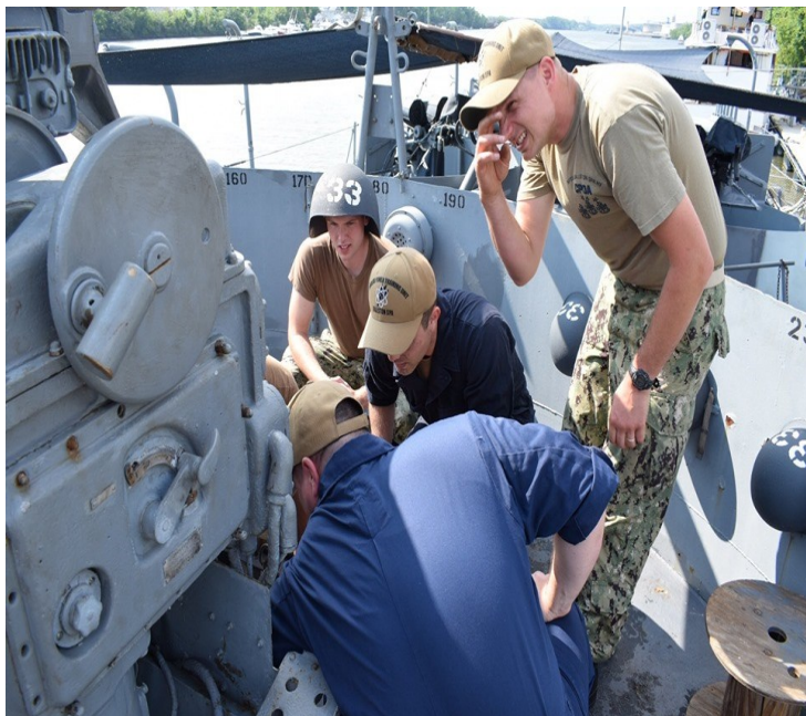
CPO Selects assisted with the disassembly of the gun 33 train gear.