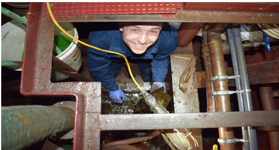
Navy CPO Selects engaged in bilge cleaning.