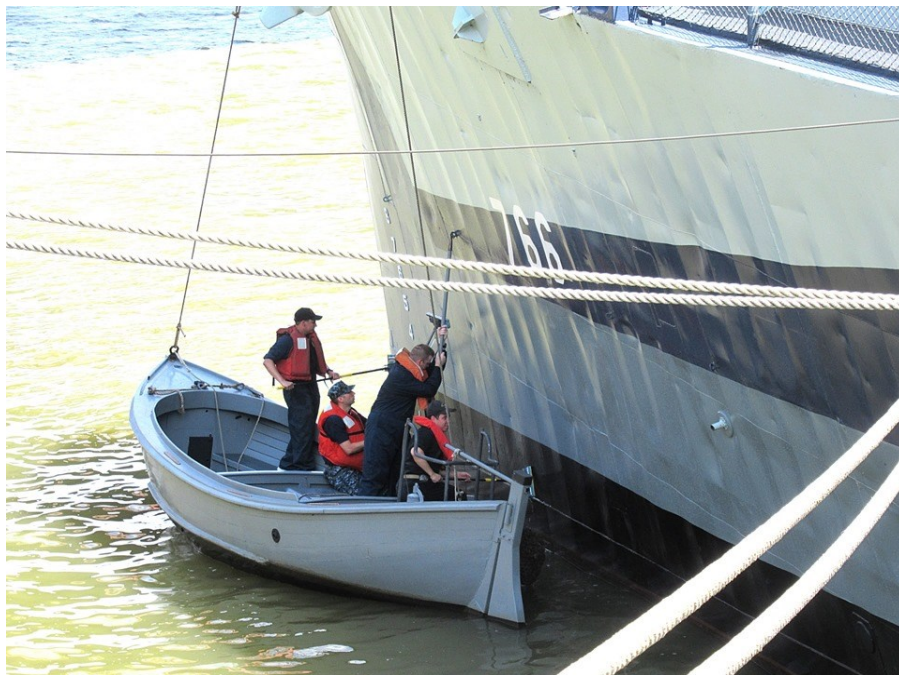
Navy CPO Selects engaged in side cleaning.

the DESA Convention will be in town. We're also looking forward to our Fall Work Week. Library presentations will include the Poughkeepsie Library at 1030 on the 14 th , and the Clifton Park-Halfmoon Library at 1030 on the 20 th . Then both the Ballston Community Library and the Watervliet Library will offer presentations at 1830 on the 24 th .