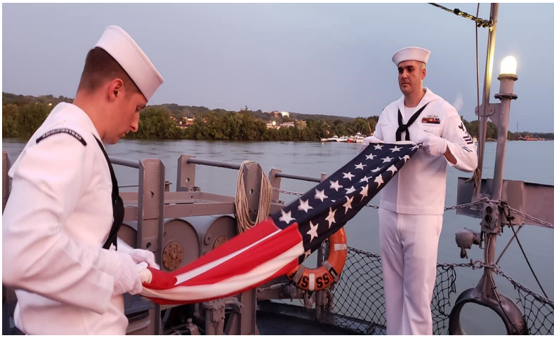
CPO Selects fold the colors as part of their volunteer weekend aboard .