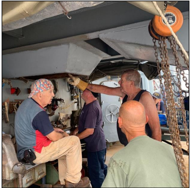
It takes the whole crew to fix the leaks in the deck above the work bench.