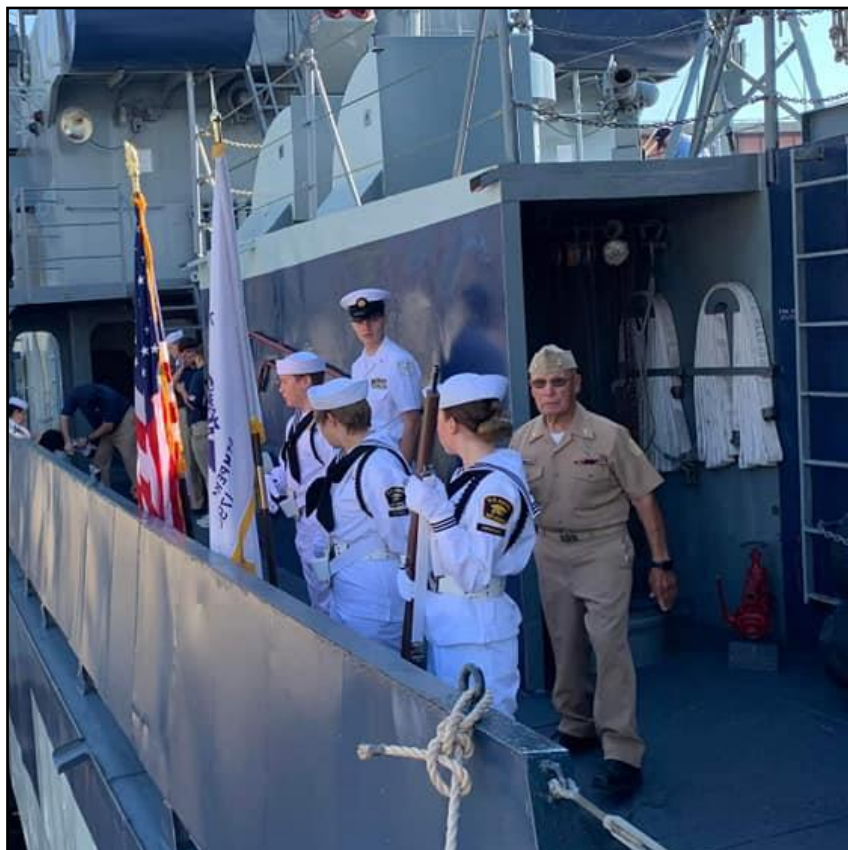
The Adirondack Battalion of the Sea Cadets served as our color guard for Coast Guard Birthday.