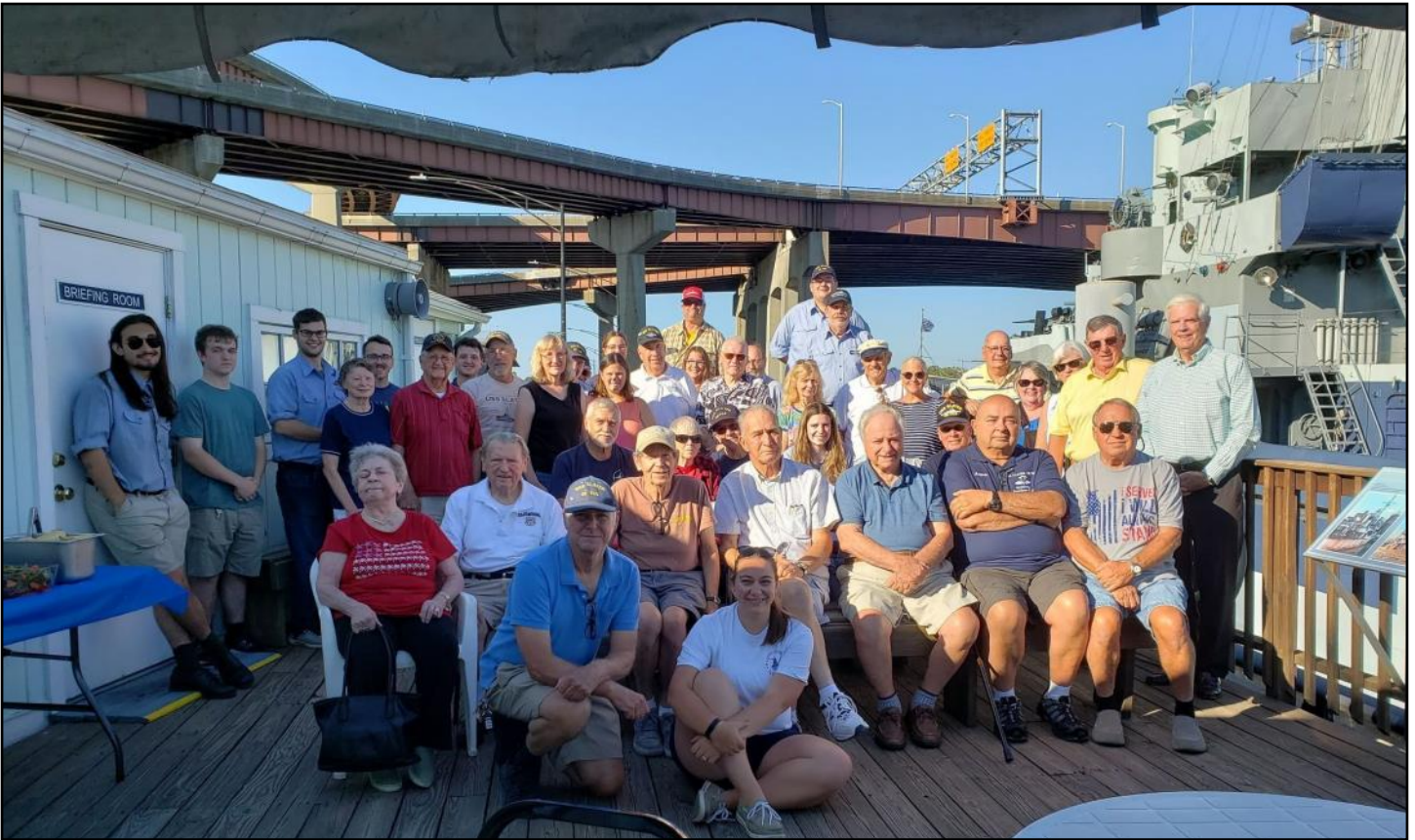
2022 Volunteer Appreciation Dinner - Thank you to all our volunteers and interns who give so much of themselves to this project. Some of them have been with us for the last 25 years!

second visit. I still remember his first meeting on the messdeck deck. I'm sure glad he didn't decide to stay home that day.